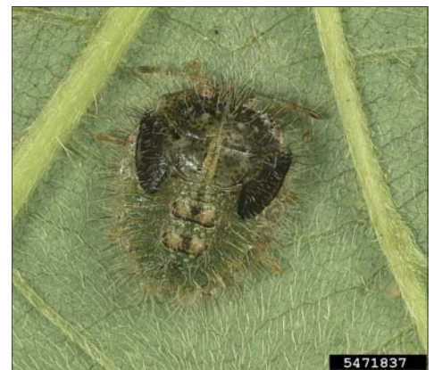
Fig. 3 – Kudzu bug nymph

vines and soybean fields in southern Maryland counties through funding from the Maryland Soybean Board. Our website ( http://mdkudzubug.org ) includes descriptions of the kudzu bug, online forms for reporting sightings, and regular updates on results of our survey this summer. If you discover what you believe to be the kudzu bug in your fields, please consider reporting it to our website. The information will help us prepare for its likelihood of becoming a soybean pest in Maryland.