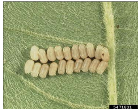
Fig. 4 – Kudzu bug eggs