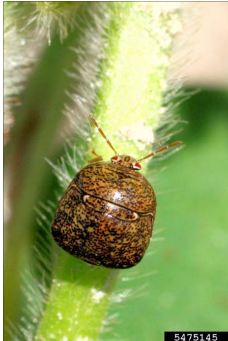
Fig. 2 – Kudzu bug adult

Adult kudzu bugs look like small beetles, but they are actually more closely related to stink bugs than to beetles. They have piercing-sucking mouthparts, rather than the characteristic chewing mouthparts for beetles. Adults measure between 3.5 to 6 mm (1/8-1/4 inch) in length, and are rounded like lady beetles. The abdomen is covered by a hard plate (scutellum) that covers the wings and makes them look like small, brown to greenish brown, mottled beetles. The shape of this scutellum gives the kudzu bug a distinctive appearance, as the posterior end is truncated, rather than narrowly rounded like in other bugs and beetles.